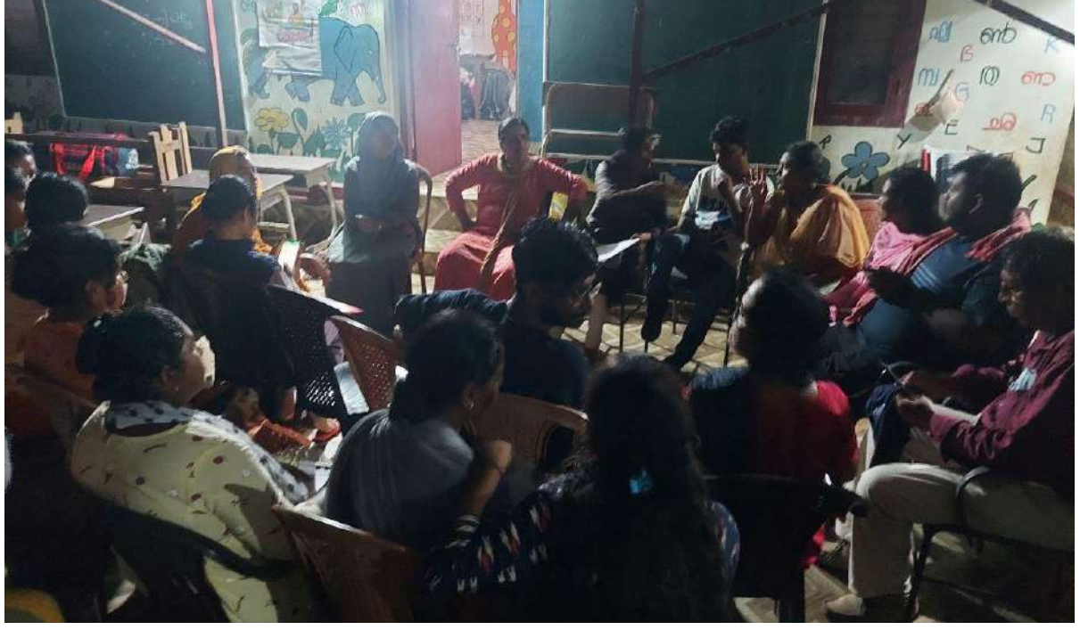
Day 2:- 18/09/2023, Monday - Event: - Inauguration and Survey

The MSW trainees awoke at 5 A.M and they refreshed. Food committee members started to prepare breakfast. At 6.00 A.M meditation and yoga session was started. After the session students were very active and felt free. At around 6.30 A.M the time management committee coordinated everyone to gather in the hall for having tea. At